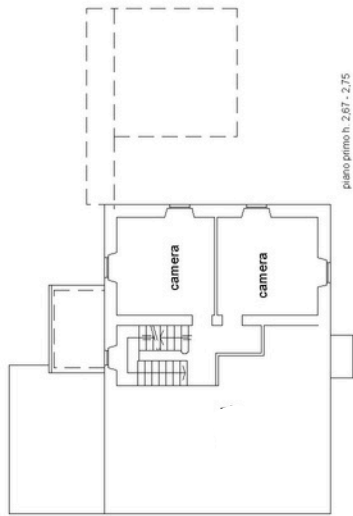
piano primo h. 2.67 - 2.75