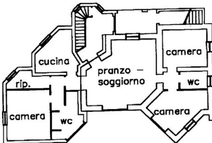
PIANO TERRA (RIALZATO) H.MT.2.70